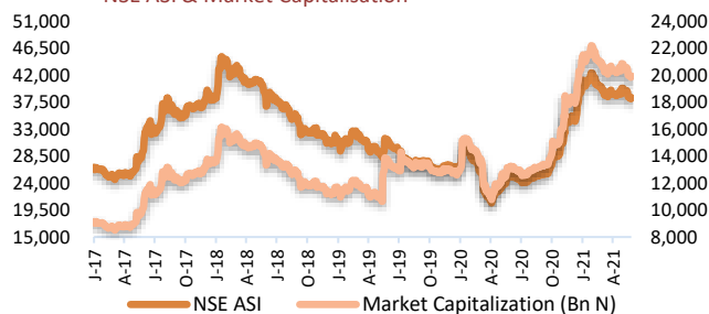
NSE ASI & Market Capitalisation

The local bourse index rebounded by 26 basis points (bps) to close at 41,249.71 points amid renewed bargain hunting activity, especially on shares of MTNN, NGXGROUP, GLAXOSMITH, FBNH and ETI as their respective share prices rose by 1.24%, 10.00%, 6.87%, 3.83% and 2.88%. Hence, the year-to-date gain of the local bourse rose to 2.43% even as the number of gainers increased to 21 as against that of the losers which stood at 18. Nevertheless, sector performance did not reflect positive market sentiment given three of the five indexes tracked which closed in red territory: the NSE Banking, NSE Consumer Goods and NSE Oil/Gas moderated by 0.20%, 0.24% and 0.39% respectively. However, the NSE Insurance and the NSE Industrial indices rose by 0.58% and 0.04% respectively. Elsewhere, market activity came in stronger as the volume and value of stocks increased by 47.47% and 25.16% to 0.49 billion units and N5.08 billion respectively. Meanwhile, NIBOR fell for most tenor buckets tracked on renewed financial system liquidity ease. However, NITTY rose for most maturities tracked on sustained bearish activity. In the OTC bonds market, the values of FGN bonds traded were muted for most maturities tracked despite the marginal increase in rates for FGN 50s maturity. However, the value of FGN Eurobond decreased for most maturities tracked on sustained sell-off.